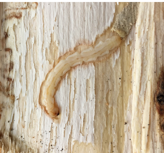
Larvae bore through the inner bark.