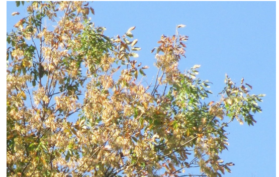
Hope for the survival of ash species depends on fresh seeds to start a new generation.

Think big. Take action. Encourage your town to plan ahead for EAB. By addressing issues before EAB arrives, the loss associated with an infestation can be spread over a longer period of time. Neighboring communities can coordinate to share resources and reduce costs. See https://vtcommunityforestry.org/community-planning/tree-pests for more information.