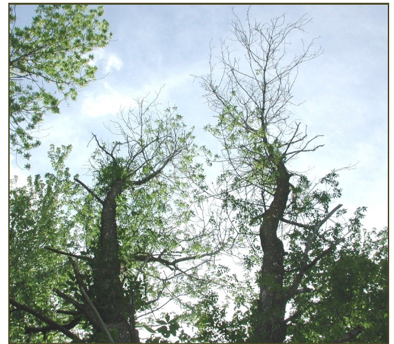
Infested trees die in 3 - 5 years.

Branches smaller than 1" in diameter can be infested. Branches, including those at the base of the canopy, are often infested first.